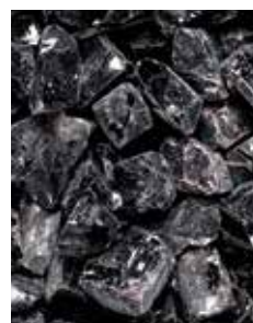
Onyx Black Media