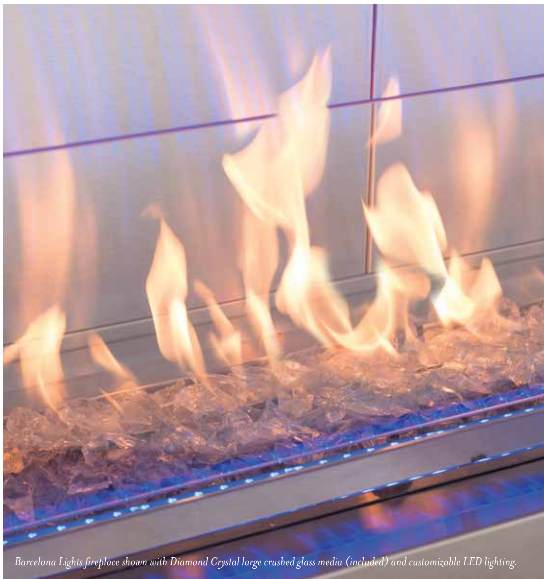
Barcelona Lights fireplace shown with Diamond Crystal large crushed glass media (included) and customizable LED lighting.