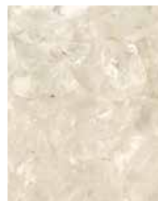
Diamond Crystal Media (included)