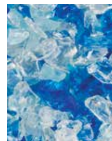
Sapphire Blue Media