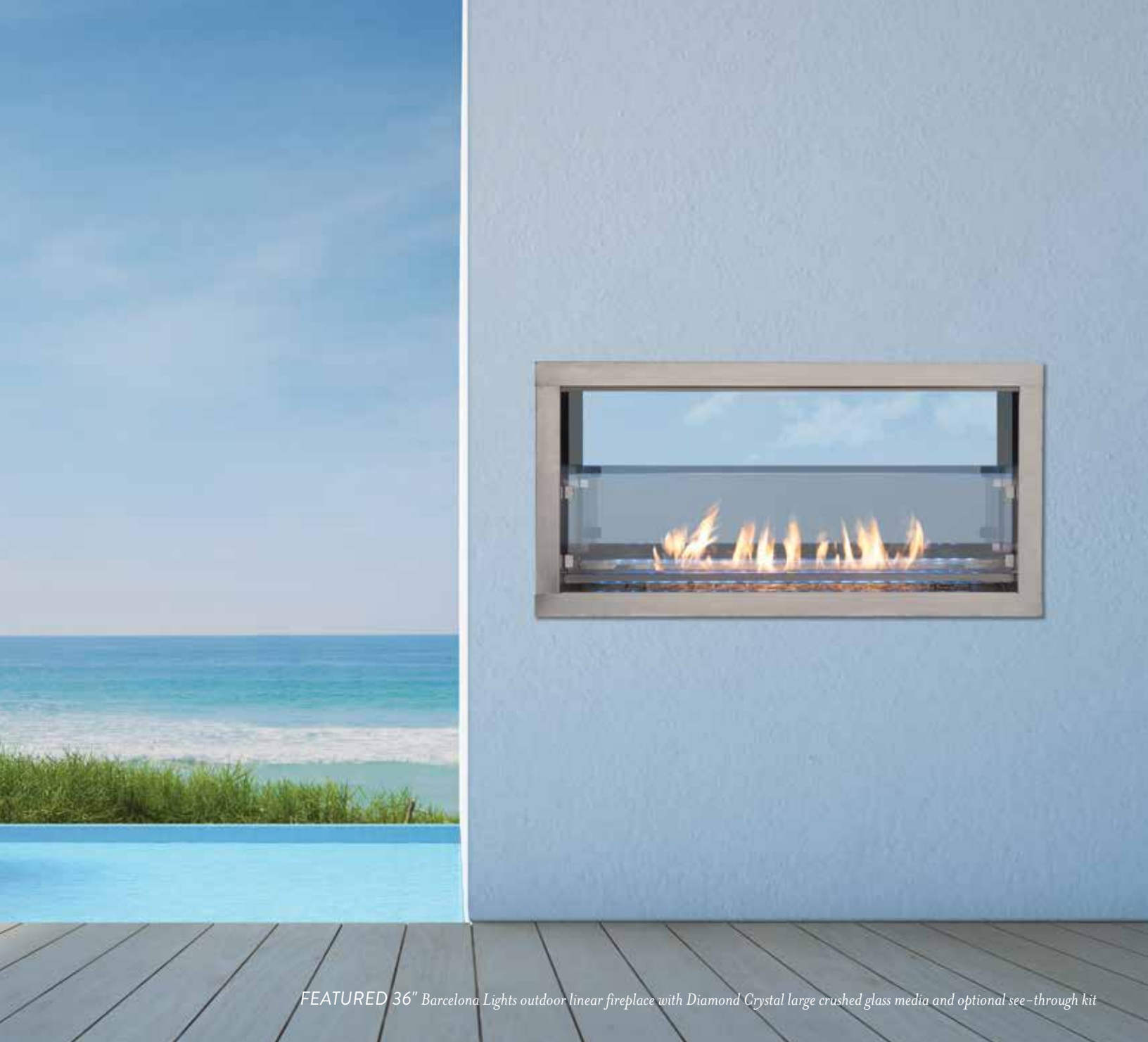
FEATURED 36" Barcelona Lights outdoor linear fireplace with Diamond Crystal large crushed glass media and optional see-through kit

The Barcelona Lights linear fireplace offers a customizable look for any outdoor living space. Set the mood or match the season with interior LED lights and flames dancing on a bed of large crushed glass. Weather-resistant stainless steel construction offers both durability and eye-catching appeal to outdoor spaces. Each Barcelona Lights fireplace allows single-sided or optional see-through installation.